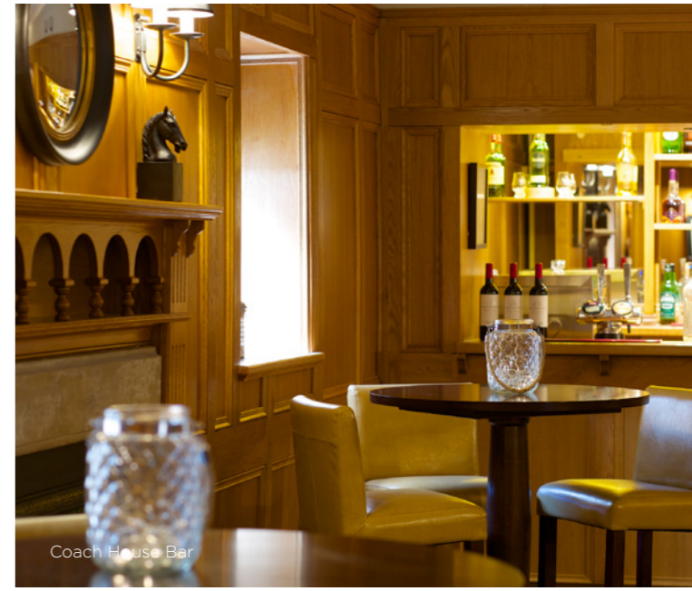
Coach House Bar