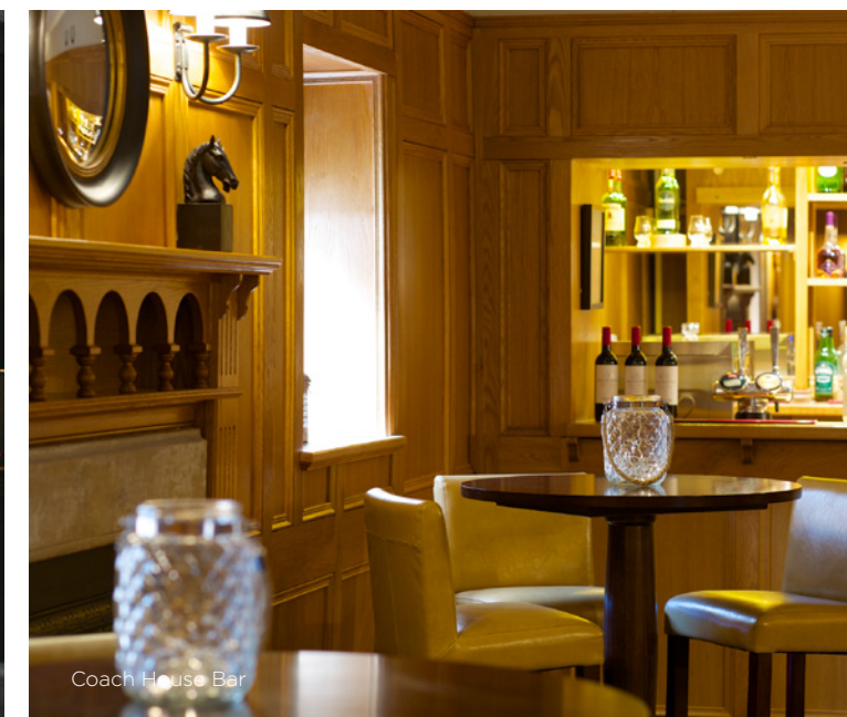
Coach House Bar